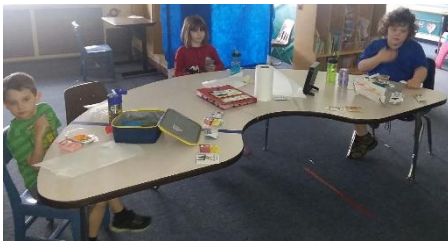
The students of Room 9