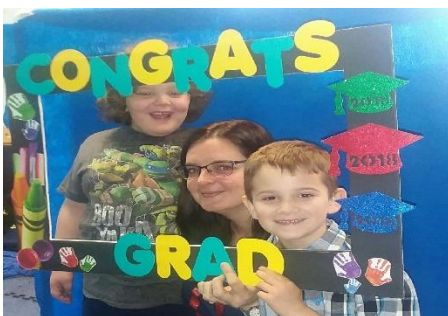
Ready for Promotion!